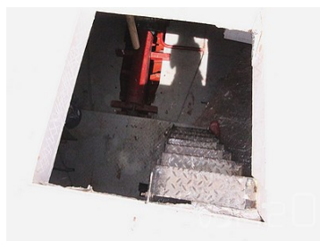
Engine room access